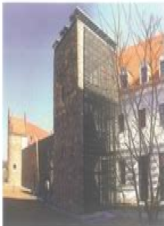
Alte Kaserne „Alte Kaserne“ architect: Jochen

Die Lage des Gebäudes ist, wie schon im 19. Jahrhundert, im Zentrum des Dorfes. Es handelt sich um einen Gebäudekomplex, der sich um einen zentralen Hof herum anordnet. Die bestehende Gebäudestruktur wurde in eine moderne, typische und typologische Struktur umgewandelt. Die bestehende Struktur wurde in eine moderne, typische und typologische Struktur umgewandelt. Die bestehende Struktur wurde in eine moderne, typische und typologische Struktur umgewandelt.