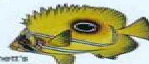
Bennett's Butterfly Fish