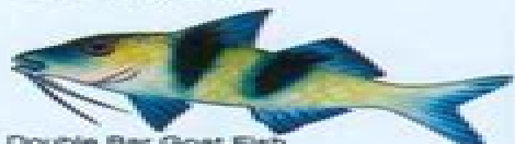
Double Bar Goat Fish