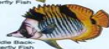
Saddle Back Butterfly Fish