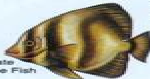
Pinnate Spade Fish