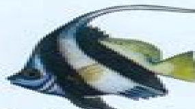
Schooling Banner Fish