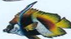
Masked Banner Fish