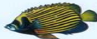
Imperial Angel Fish