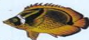
Raccoon Butterfly Fish