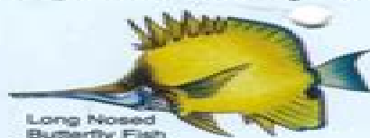
Long Nosed Butterfly Fish