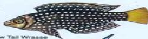
Yellow Tail Wrasse