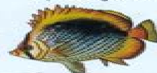
Black Backed Butterfly Fish