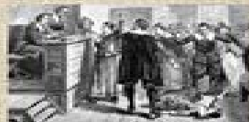
Witchcraft Trials in Salem show the mistrust in society for diversity.