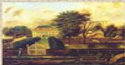
Colonial Plantation Life