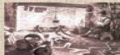
Early colonial life was sometimes harsh especially on rural farms