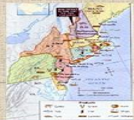
Northern Colonies had economies that were much more diverse. Agriculture, fishing, and trading were all important activities.