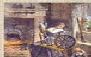
Colonial Women mainly worked in the home and have very few legal rights.