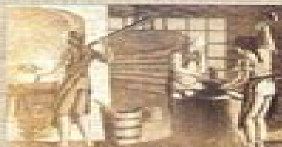
Many colonists practiced a specific trade passed from one generation to another