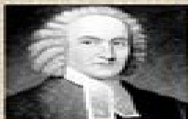
Great Awakenings preacher Jonathon Edwards