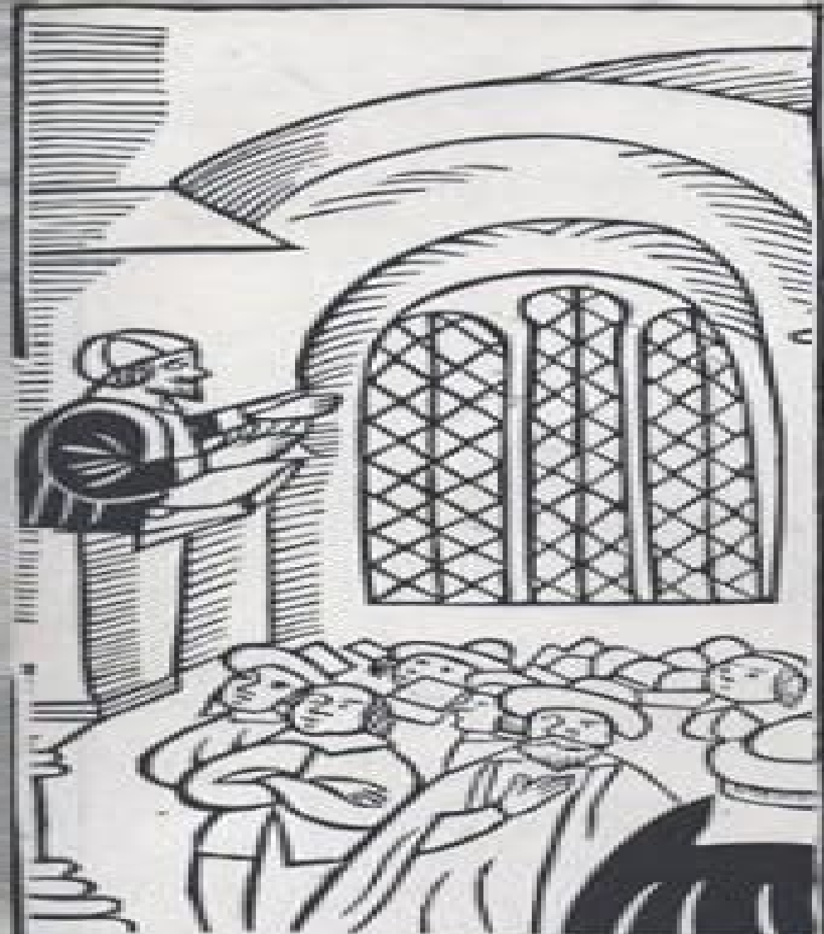
The Orthodox true Minister,