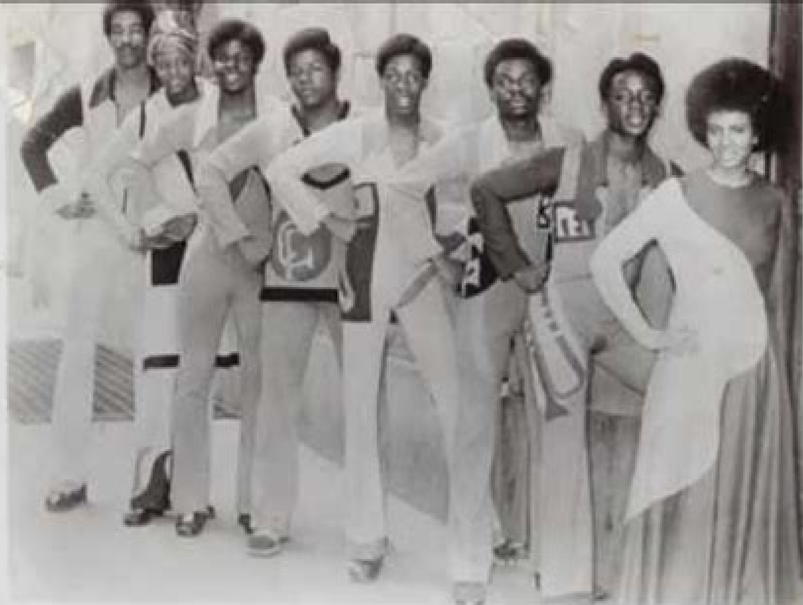
2000 Year 2000 New York, N. Y., 2000