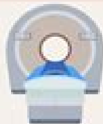
Positron emission tomography