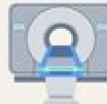
X-ray computed tomography