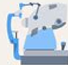
Optical coherence tomography