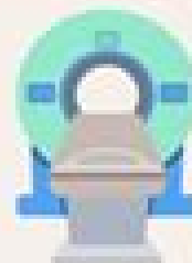
Magnetic resonance imaging