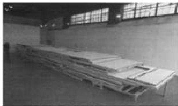
Charles Goldman, NOHS, 1996 , mixed media, installation view.