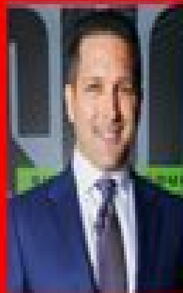
ADAM SCHEFTER SENIOR INSIDER