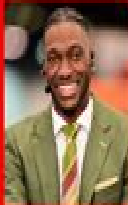
ROBERT GRIFFIN III ANALYST