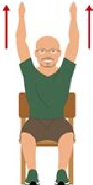
Overhead Arm Raises