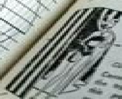
PORTABLE DRESSING ROOM