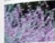
Prevention 'Bare Arms' Millions of people have already received vaccinations for a deadly disease that causes death in 100 percent of the cases. The disease is called AIDS, and it is caused by the human immunodeficiency virus (HIV). The virus is spread by blood, semen, and other body fluids.