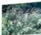
1. Introduction 2. Background 3. Methodology 4. Results 5. Conclusion 6. References 7. Appendix 8. Index 9. Table of Contents 10. Figure of Contents 11. Table of Figures 12. Table of Tables 13. Table of Equations 14. Table of Symbols 15. Table of Abbreviations 16. Table of Acronyms 17. Table of Units 18. Table of Constants 19. Table of Variables 20. Table of Parameters 21. Table of Functions 22. Table of Operators 23. Table of Symbols 24. Table of Abbreviations 25. Table of Acronyms 26. Table of Units 27. Table of Constants 28. Table of Variables 29. Table of Parameters 30. Table of Functions 31. Table of Operators 32. Table of Symbols 33. Table of Abbreviations 34. Table of Acronyms 35. Table of Units 36. Table of Constants 37. Table of Variables 38. Table of Parameters 39. Table of Functions 40. Table of Operators 41. Table of Symbols 42. Table of Abbreviations 43. Table of Acronyms 44. Table of Units 45. Table of Constants 46. Table of Variables 47. Table of Parameters 48. Table of Functions 49. Table of Operators 50. Table of Symbols 51. Table of Abbreviations 52. Table of Acronyms 53. Table of Units 54. Table of Constants 55. Table of Variables 56. Table of Parameters 57. Table of Functions 58. Table of Operators 59. Table of Symbols 60. Table of Abbreviations 61. Table of Acronyms 62. Table of Units 63. Table of Constants 64. Table of Variables 65. Table of Parameters 66. Table of Functions 67. Table of Operators 68. Table of Symbols 69. Table of Abbreviations 70. Table of Acronyms 71. Table of Units 72. Table of Constants 73. Table of Variables 74. Table of Parameters 75. Table of Functions 76. Table of Operators 77. Table of Symbols 78. Table of Abbreviations 79. Table of Acronyms 80. Table of Units 81. Table of Constants 82. Table of Variables 83. Table of Parameters 84. Table of Functions 85. Table of Operators 86. Table of Symbols 87. Table of Abbreviations 88. Table of Acronyms 89. Table of Units 90. Table of Constants 91. Table of Variables 92. Table of Parameters 93. Table of Functions 94. Table of Operators 95. Table of Symbols 96. Table of Abbreviations 97. Table of Acronyms 98. Table of Units 99. Table of Constants 100. Table of Variables 101. Table of Parameters 102. Table of Functions 103. Table of Operators 104. Table of Symbols 105. Table of Abbreviations 106. Table of Acronyms 107. Table of Units 108. Table of Constants 109. Table of Variables 110. Table of Parameters 111. Table of Functions 112. Table of Operators 113. Table of Symbols 114. Table of Abbreviations 115. Table of Acronyms 116. Table of Units 117. Table of Constants 118. Table of Variables 119. Table of Parameters 120. Table of Functions 121. Table of Operators 122. Table of Symbols 123. Table of Abbreviations 124. Table of Acronyms 125. Table of Units 126. Table of Constants 127. Table of Variables 128. Table of Parameters 129. Table of Functions 130. Table of Operators 131. Table of Symbols 132. Table of Abbreviations 133. Table of Acronyms 134. Table of Units 135. Table of Constants 136. Table of Variables 137. Table of Parameters 138. Table of Functions 139. Table of Operators 140. Table of Symbols 141. Table of Abbreviations 142. Table of Acronyms 143. Table of Units 144. Table of Constants 145. Table of Variables 146. Table of Parameters 147. Table of Functions 148. Table of Operators 149. Table of Symbols 150. Table of Abbreviations 151. Table of Acronyms 152. Table of Units 153. Table of Constants 154. Table of Variables 155. Table of Parameters 156. Table of Functions 157. Table of Operators 158. Table of Symbols 159. Table of Abbreviations 160. Table of Acronyms 161. Table of Units 162. Table of Constants 163. Table of Variables 164. Table of Parameters 165. Table of Functions 166. Table of Operators 167. Table of Symbols 168. Table of Abbreviations 169. Table of Acronyms 170. Table of Units 171. Table of Constants 172. Table of Variables 173. Table of Parameters 174. Table of Functions 175. Table of Operators 176. Table of Symbols 177. Table of Abbreviations 178. Table of Acronyms 179. Table of Units 180. Table of Constants 181. Table of Variables 182. Table of Parameters 183. Table of Functions 184. Table of Operators 185. Table of Symbols 186. Table of Abbreviations 187. Table of Acronyms 188. Table of Units 189. Table of Constants 190. Table of Variables 191. Table of Parameters 192. Table of Functions 193. Table of Operators 194. Table of Symbols 195. Table of Abbreviations 196. Table of Acronyms 197. Table of Units 198. Table of Constants 199. Table of Variables 200. Table of Parameters 201. Table of Functions 202. Table of Operators 203. Table of Symbols 204. Table of Abbreviations 205. Table of Acronyms 206. Table of Units 207. Table of Constants 208. Table of Variables 209. Table of Parameters 210. Table of Functions 211. Table of Operators 212. Table of Symbols 213. Table of Abbreviations 214. Table of Acronyms 215. Table of Units 216. Table of Constants 217. Table of Variables 218. Table of Parameters 219. Table of Functions 220. Table of Operators 221. Table of Symbols 222. Table of Abbreviations 223. Table of Acronyms 224. Table of Units 225. Table of Constants 226. Table of Variables 227. Table of Parameters 228. Table of Functions 229. Table of Operators