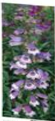
Penetration 'Too Simple' "Penetration is not a simple matter," says a senior executive at a major U.S. bank. "It's a complex process that involves a lot of factors, including the size of the market, the level of competition, and the resources available to the company. It's not a simple matter to penetrate a new market."