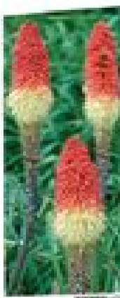
Kniphofila agaveifolia With a combination of upright, pointed grass-like leaves and a dense, rounded spike of bell-shaped red and yellow flowers, this plant is a striking addition to any garden. It is a hardy perennial that grows in full sun and well-drained soil. The flowers are borne on a single stem at the top of the plant. (Info on Kniphofila)