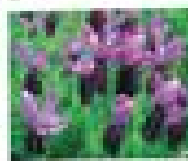
Laurelville Wildlife Refuge 10000 Laurelville Road, Laurelville, OH 44655 440-333-2222 www.dnr.state.oh.us/wildlife/laurelville.htm