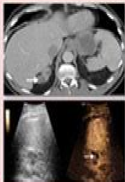
Clear cell papillary RCC

Solid heterogeneous tumor with minor cystic changes