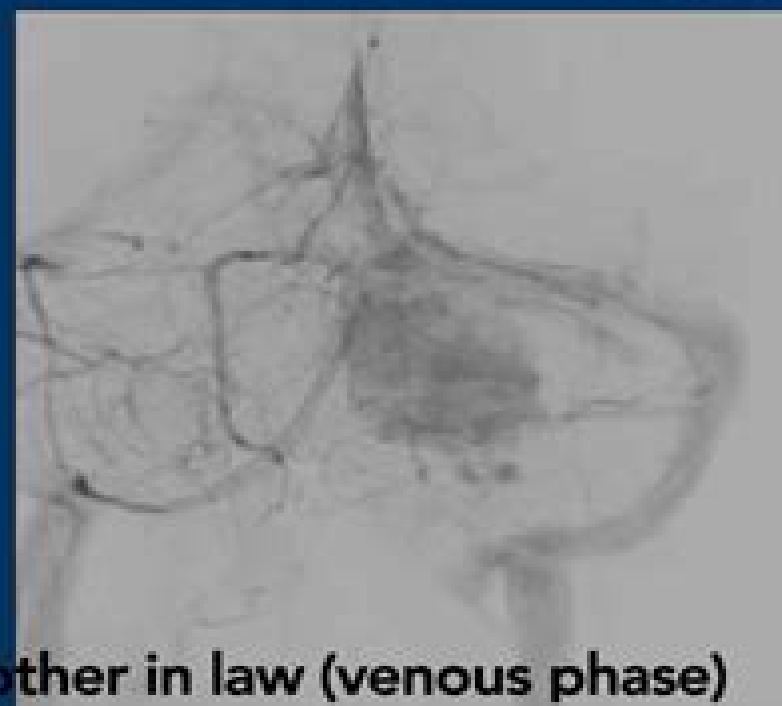
Mother in law (venous phase)