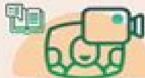
Online Instructions and Orientations