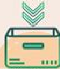
Drop box for Book Returns