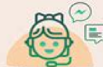
Online Reference Services via Chat-a-Librarian, Email, & Facebook