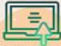
Online Book Borrowing

Library services in the new normal. Visit the library website for more information.