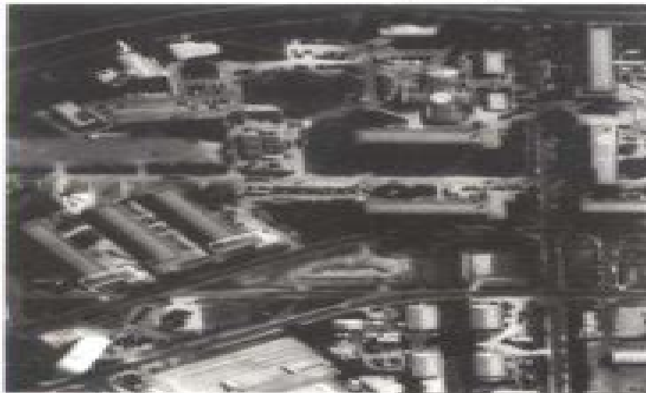
Image Understanding for Imagery Intelligence