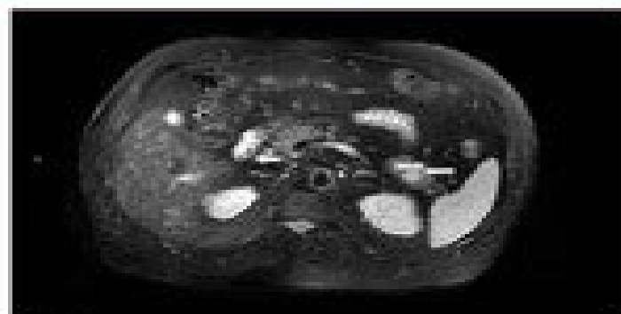
Figure 2 T2 MRI image of abdomen