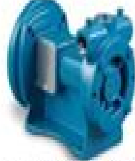
Regenerative Turbine Pump