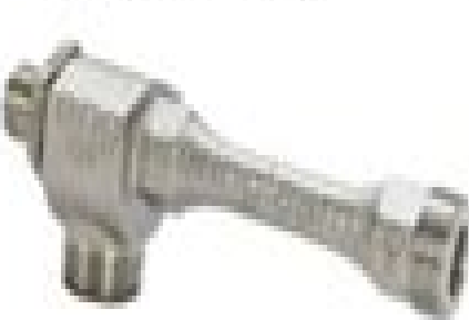
Eductor Jet Pump