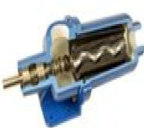
Progressing Cavity Pump