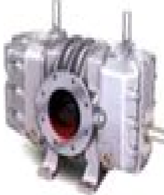
Root Type Pump