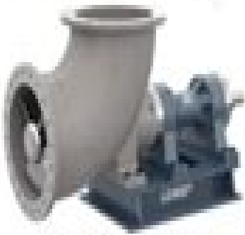
Axial Flow Pump