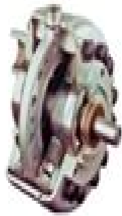
Radial Piston Pump