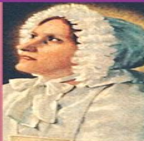
Bl. Anna Maria Taigi (1769-1837), wife, mother of seven, mystic and counselor of Popes and Saints.