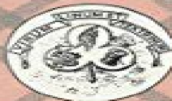
Updegraff Seal UPDEGRAFF