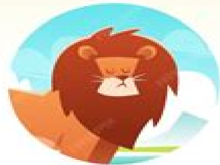
WILD ANIMALS TRADE