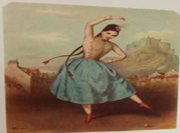
2. Fanny Elssler in "The Cossack's Dance" 1846. A.A. 67417