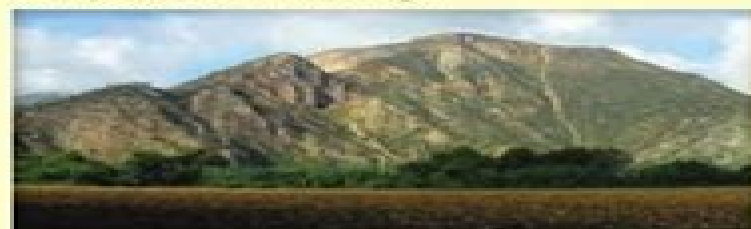
✦ Biodiversidad de la Barranca de Metztitlán, Hidalgo.