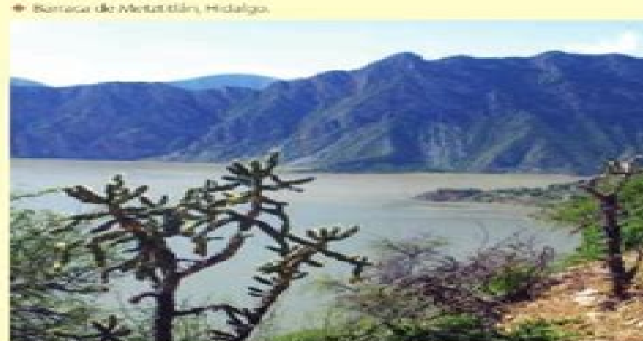
✦ Barranca de Metztitlán, Hidalgo.