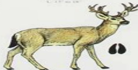
COLUMBIA BLACK-TAILED DEER Odocoileus columbianus SH: 42"

KEY—COMMON NAME Scientific Name L: Length of body including tail SH: Height at shoulder W: Wingspan