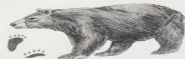
BLACK BEAR Ursus americanus SH: 36" to 42"