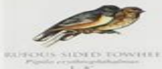
RUFUS-SIDED TOWHEE Pipilo erythrophthalmus L: 8"