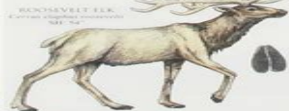
ROOSEVELT ELK Cervus elaphus roosevelti SH: 54"