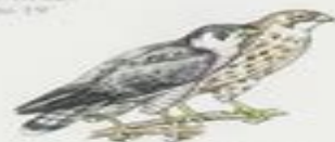
PEREGRINE FALCON Falco peregrinus L: 15" W: 30"