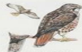
RED-TAILED HAWK Buteo lineatus L: 18" to 25" W: 48"