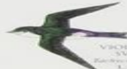
VIOLET-GREEN SWALLOW Icterus spurius L: 5" to 5.5"

KEY—COMMON NAME Scientific Name L: Length of body including tail SH: Height at shoulder W: Wingspan