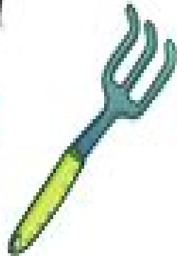
Small hand rake