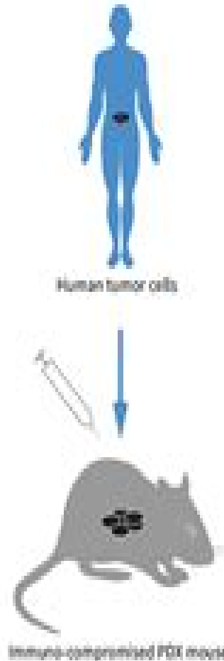
PDX (patient derived xenograft)