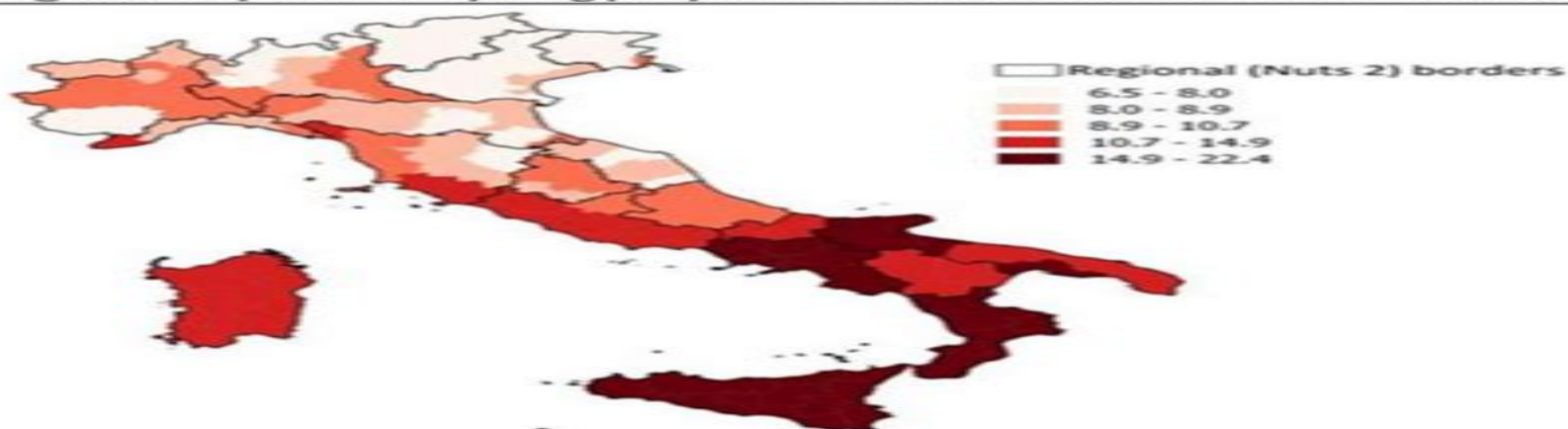
Fig. 4c. Proportion of households potentially suffering economic hardship (c)