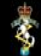
Royal Electrical & Mechanical Engineers