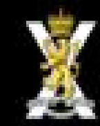
Royal Regiment of Scotland