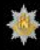
Royal Anglian Regiment