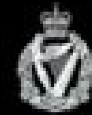
Royal Irish Regiment