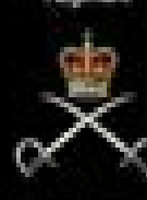
Royal Army Physical Training Corps