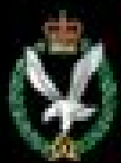
Army Air Corps