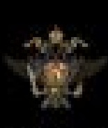
Queen's Dragoon Guards