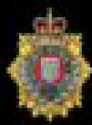
Royal Logistic Corps