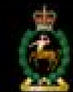
Royal Army Veterinary Corps