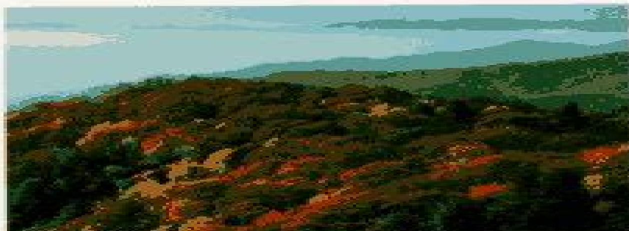
The majestic forest of the Great Smoky Mountains.