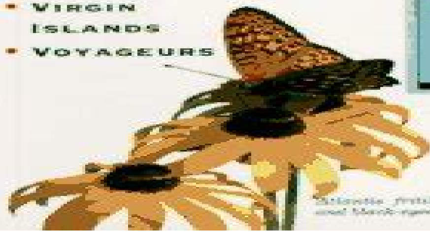
Atlantic fritillary butterfly and black-eyed Susans.