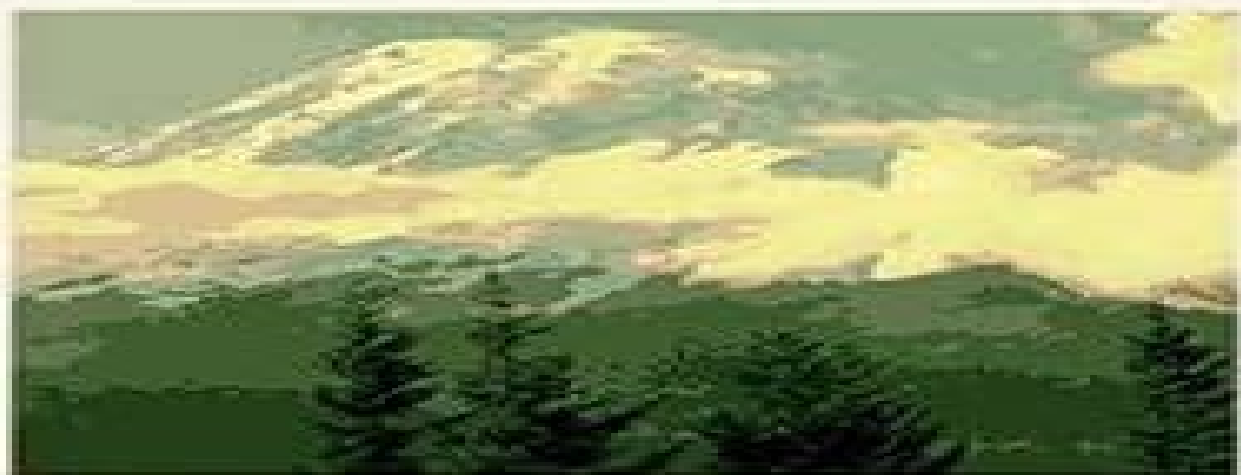
Mount Rainier, a Washington State landmark.