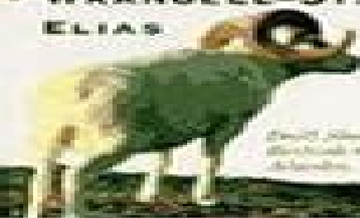
Bighorn sheep, ranging from British Columbia to Alaska.