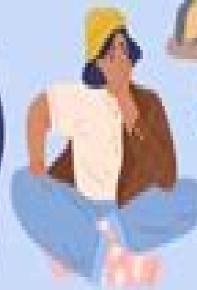
The Upward Turn