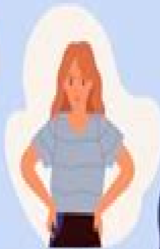
Anger & Bargaining