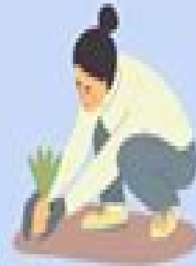
Reconstruction & Working Through