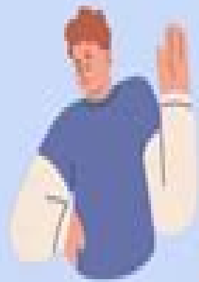
Shock & Denial