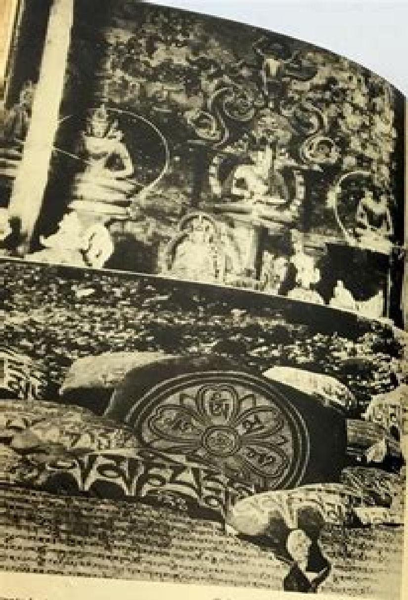
Shrines in the Temple of Klu.