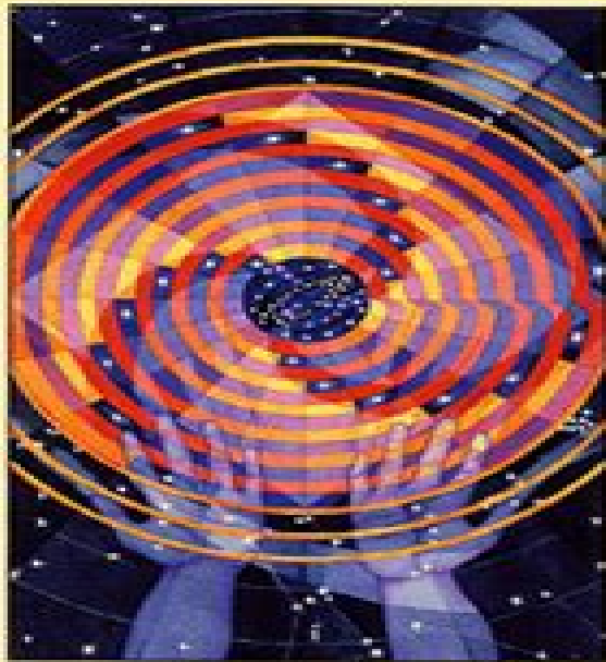
4 OUT BEYOND ORION