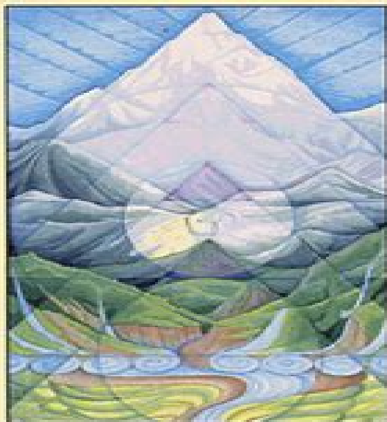
14 HIMALAYAN PASSAGE