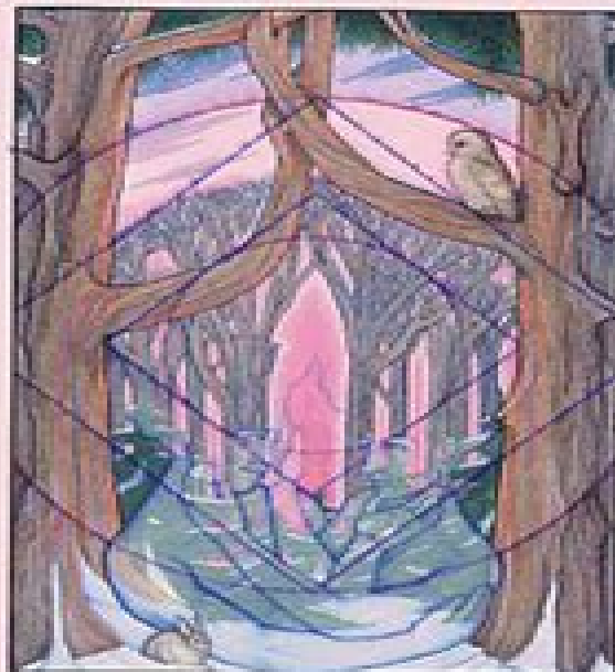
17 MORNING MEETING