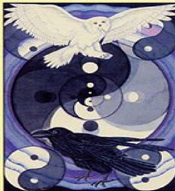
7 OWL/RAVEN - YIN/YANG