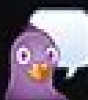
Pidgin Internet ...