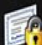
Smart Card Ma...