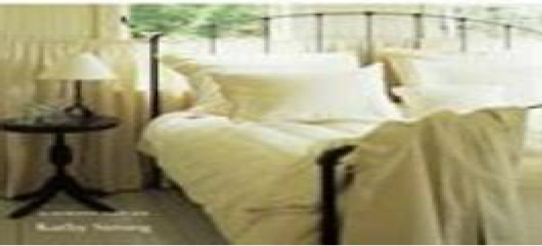
Illustration by Blair Day Thompson