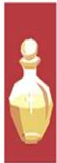
Anointing of the Sick