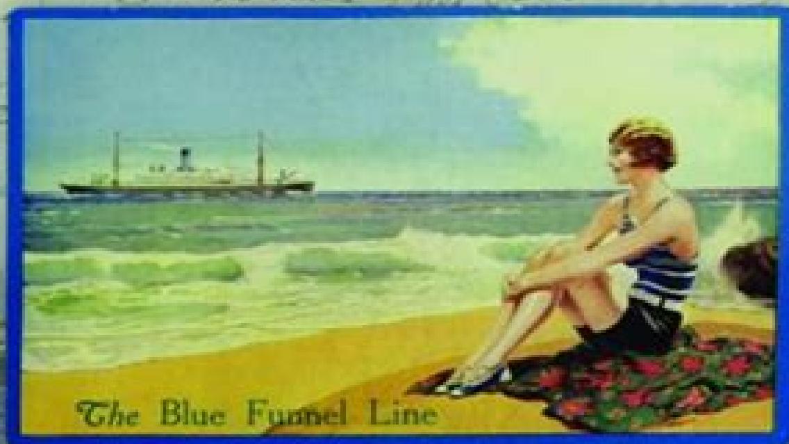
The Blue Funnel Line