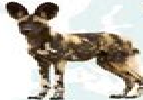
African Wild Dog