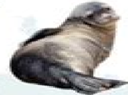
Hawaiian Monk Seal