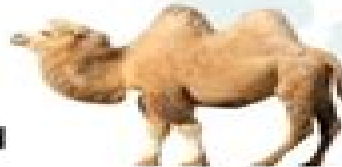
Wild Bactrian Camel