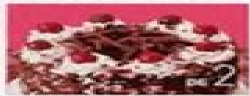
Black Forest cake