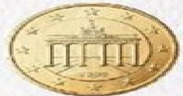
EUR 10 cent