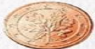
EUR 1 cent