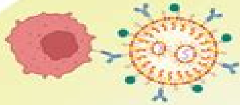
Immune checkpoint inhibitors