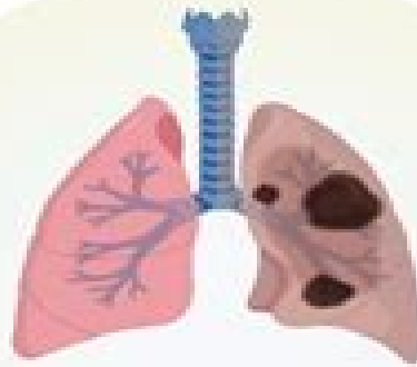
Conventional Therapies of Lung Cancer