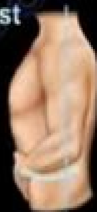
Belly Press Test