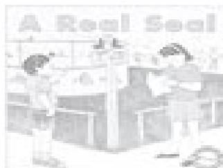
A Real Seal