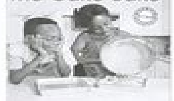
The Cake Bake