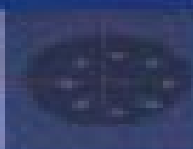
Cataract and Refractive Surgery