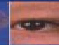
Strabismic, Ophthalmic, Neuro- ophthalmic, Genetics