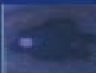
Strabismic and Non-strabismic Amblyopia