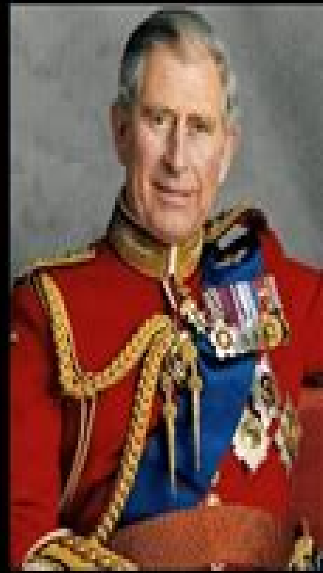
King Henry VIII Queen Victoria Queen Elizabeth King Charles III