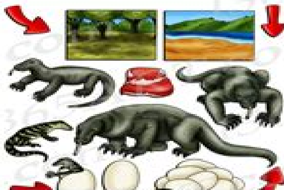
Komodo Dragon Life Cycle Clipart