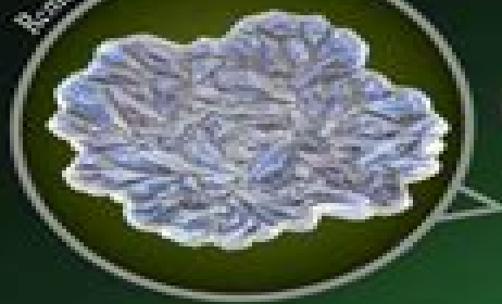
Removable Hole Knoll Insert