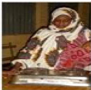
Clean Cook Stove (Top) Partial View of Kebribeyah Camp (Right)