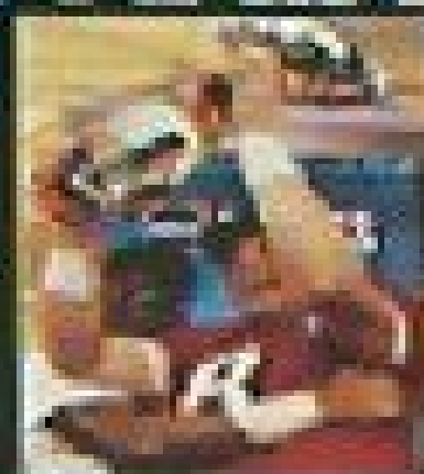
PLAYBOOK BY DAVE FELTS