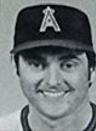
NOLAN RYAN, California Angels