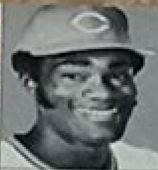
GEORGE FOSTER, Cincinnati Reds

MAJOR AND MINOR LEAGUE BASEBALL • COMPLETE PLAYER-TEAM DIRECTORY • MAJOR LEAGUE BASEBALL • 1978