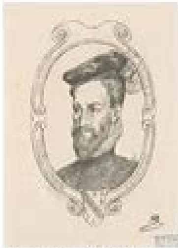
Joachim Du Bellay