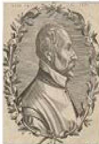
Pontus de Tyard