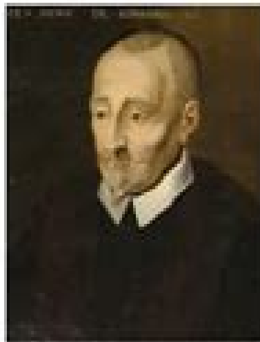
Pierre de Ronsart