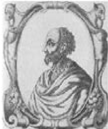
Antoine de Baif