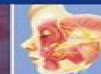
Oculoplastics and Orbit