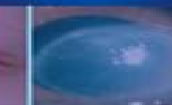
Cornea and External Eye Disease