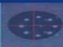
Cataract and Refractive Surgery