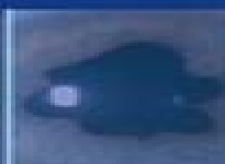
Uveitis and Immunological Disorders